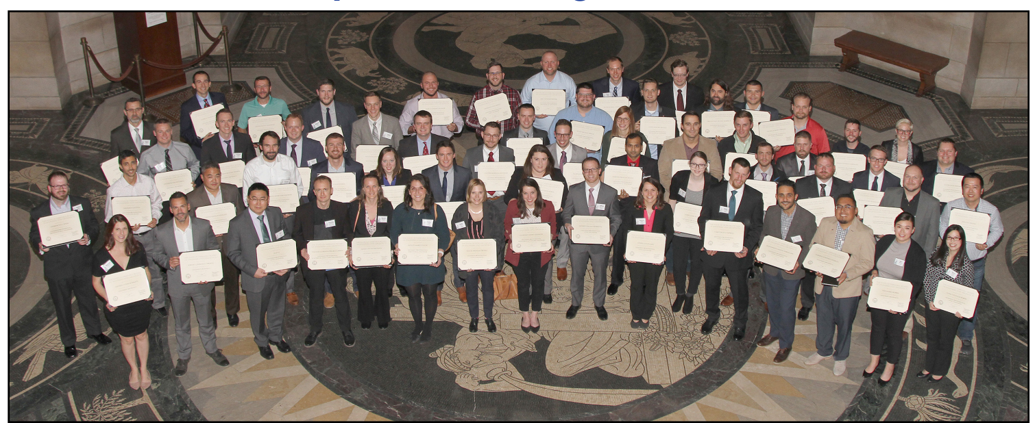
Licensees pose with their certificates in the Rotunda of the Nebraska State Capitol on November 15, 2019. In total, 18 architects and 119 professional engineers were licensed since November 2018. This is the 15th year the Board has held a Ceremony honoring individuals licensed by exam.